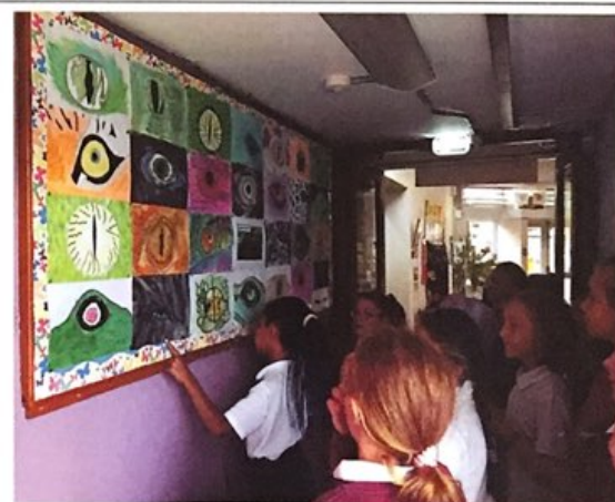
ANIMAL EYES ART. Second Class Girls enjoy this amazing artwork displayed in the corridor this month. Sixth Class girls have shown their creativity with this project.