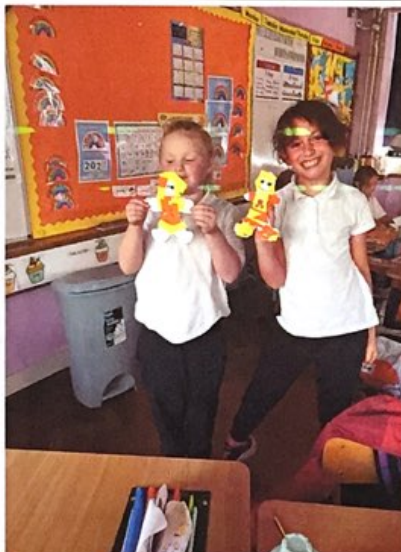
We love the 'Gingerbread Men' created By girls in Rang a Haon.