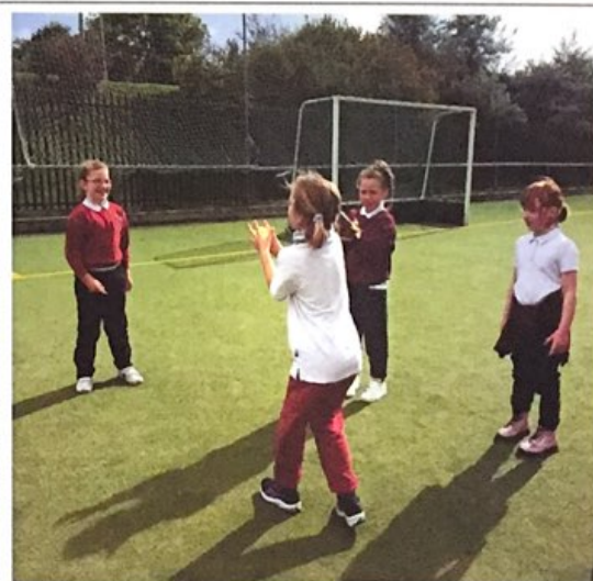
Throwing and Catching Skillset.