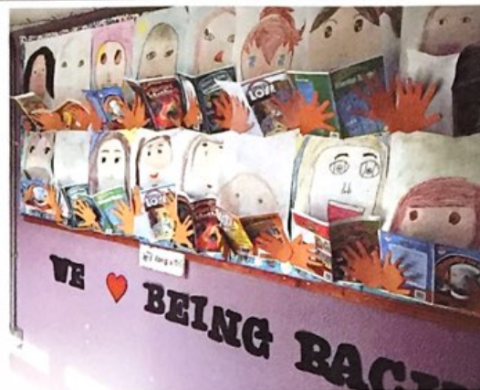
We love this positive message from Rang a Trí.