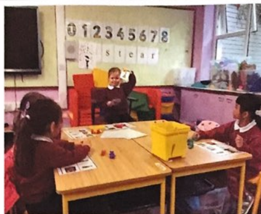
Theme: My Home.