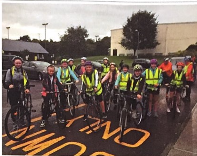
Plenty of Smiles on arrival at St. Joseph's!!