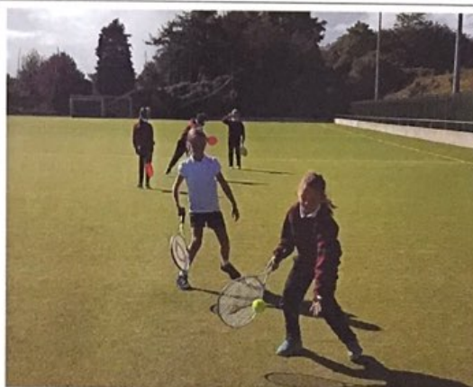
Our sunny days in September were ideal for perfecting our tennis skills.