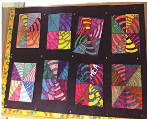
Great Pattern and Colour on display in the creations by Rang a Ceathair.