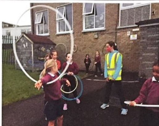
We are delighted to introduce our 'Buddy' Programme in St. Joseph's again this year. Sixth Class girls volunteer to play games with the pupils in the Junior Playground.