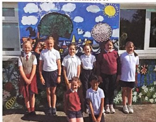
Members of our Active Schools Committee 2021/2022.

Our Active Schools Committee is made up of two girls from classes 3 rd -6 th .