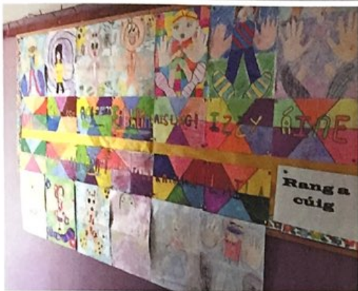
Falling Back Art and Colourful Christian Names from Rang a Cúig.