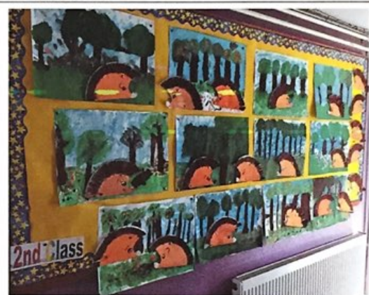
A story from their reader, Harry Hedgehog' Inspires our Girls in Rang a Dó.