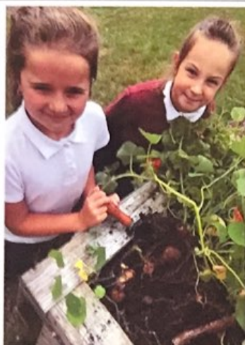
Great Success for our First Class Girls. They harvested their vegetables which they Planted last Spring. A great selection of rhubarb ,potatoes, beetroot, leeks etc.